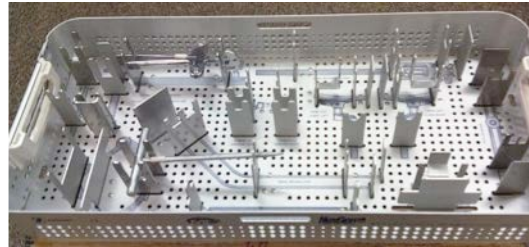
FIGURE 1: SURGICAL INSTRUMENT TRAY WITH XS ENABLED TOOLS

But there are now UHF tags available that can be used in these environments, and UHF interrogators can be tuned to avoid unwanted tag reads. In an operating room, the advantage of UHF would be the possibility of reading a large number of tagged surgical tools at once -- and for complex surgeries, the number of tools used can number as many as 600.