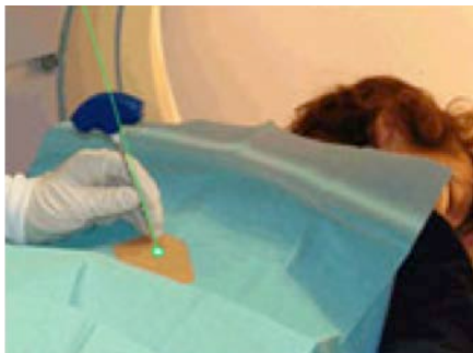
FIGURE 4 MINIMALLY INVASIVE SURGERY

Integrated Business Systems and Services (IBSS) and Jamison Door deployed a heavy-duty RFID portal for the OR linen cart exit to the laundry and decontamination rooms. The portal includes ThingMagic Mercury5 RFID readers and antennas to read RFID tags attached to the surgical instruments. The Xerafy tags, because of their small size, can attach to surgical instruments without interfering with the use of the tool.