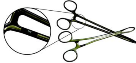
FIGURE 2 XS TAGS CAN BE EMBEDDED IN SURGICAL TOOLS

Retained surgical instruments left behind in a patient can lead to infections and other complications, greatly increasing the cost of care. If an item is unaccounted for at the end of a procedure, staff must locate it before the procedure can be completed, at a cost of approximately $150 to $400 per minute of clinical time.