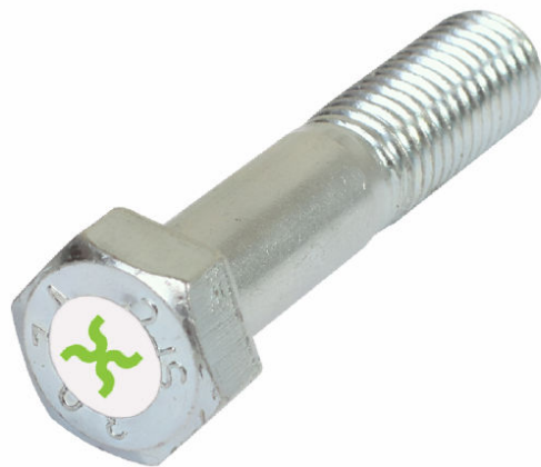
FIGURE 2: XERAFY PICO-IN TAG EMBEDDED IN BOLT

By integrating sensors, actuators and other technology with RFID, assets within the oil and gas industry could report on environmental conditions, equipment operation, safety data, regulatory compliance conditions and other information, in addition to location data. By extending the information network out to specific field assets, oil and gas companies could achieve a new level of visibility into remote operations that could both improve operational productivity, as well as safety.