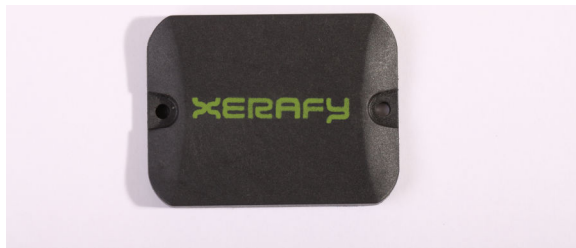
FIGURE 5: XERAFY MicroX TAG

The Micro X tag is currently being piloted for asset