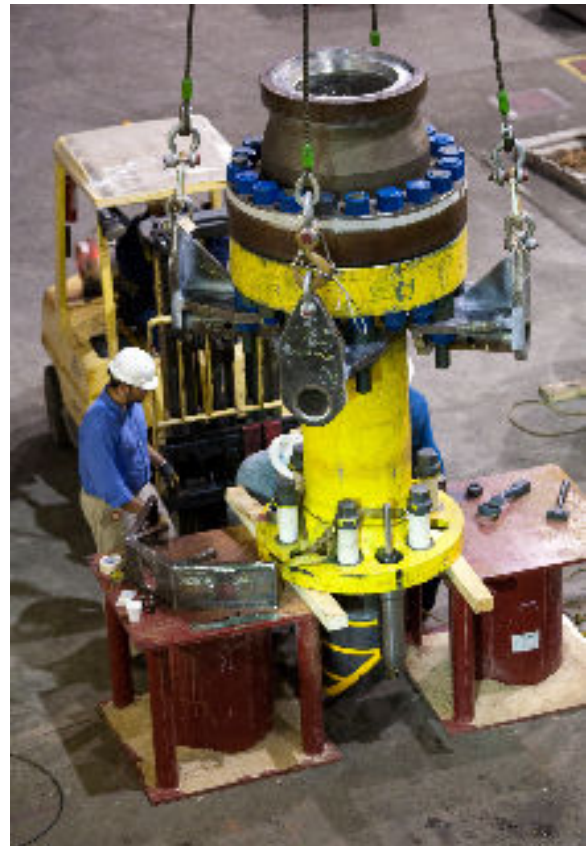
FIGURE 6: RFID TAG INSERTED ON LIFT HOOK BY XERAFY PARTNER, HOLLAND1916, TO HELP STOP BP OIL LEAK

The RFID data collection equipment automatically tracks and manages supplies as they move from onshore operations facilities, to port transfer