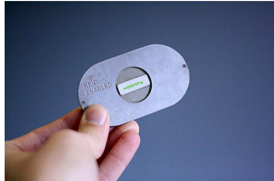
FIGURE 3: XERAFY MICRO-IN TAG EMBEDDED IN METAL PLATE

Human error is inevitable, but when it comes to a crucial process as ensuring that customers receive their shipment on time, much less, the CORRECT shipment. Finding the right pipe in a field and ensuring product meets API specifications based on outer diameter, wall thickness, steel grade, weight / unit length, and type of coupling is a common scenario in the oil and gas industry, and errors could