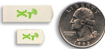
Xerafy XL tags with Tego's IC